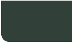
2847 ROYCROFT BOTTLE GREEN