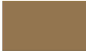
7700 OLDE WORLD GOLD