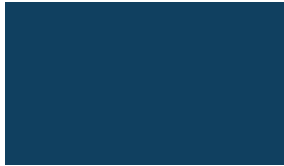
6510 LOYAL BLUE