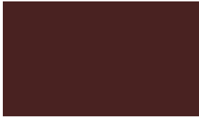
2801 ROOKWOOD DARK RED